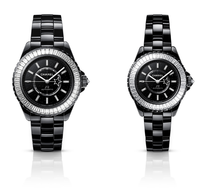
J12 NIGHT STAR 38 MM AND 33 MM

Two new CHANEL Haute Horlogerie creations set with diamonds, in 38 and 33 mm. Each has a black glitter-effect dial traversed by a comet in constant movement.