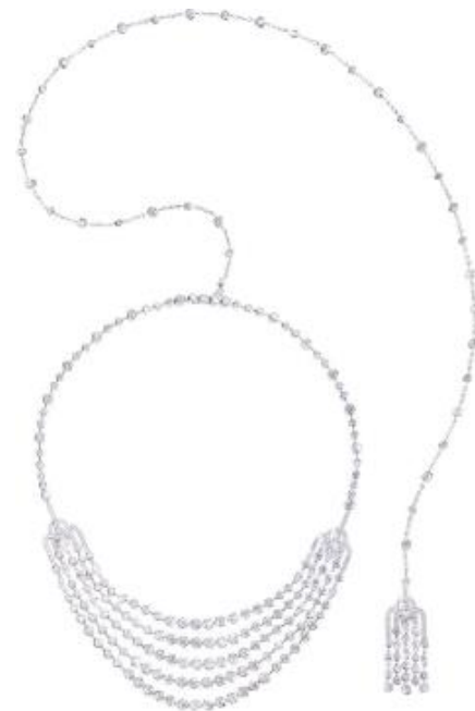
Worn by Fan Bingbing as Lin Mi Sheng in THE 355