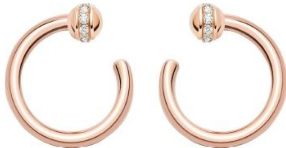
Worn by Fan Bingbing as Lin Mi Sheng in THE 355