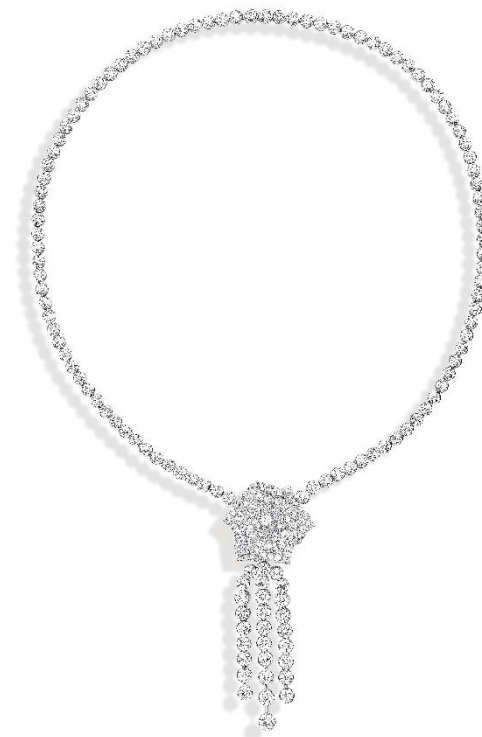
Worn by Penélope Cruz as Graciela in THE 355