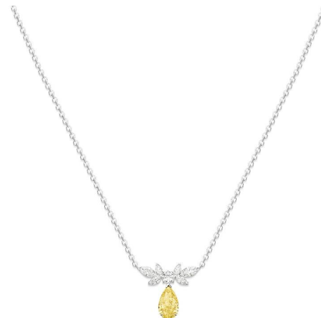
Worn by Jessica Chastain as Mason, «Mace» in THE 355