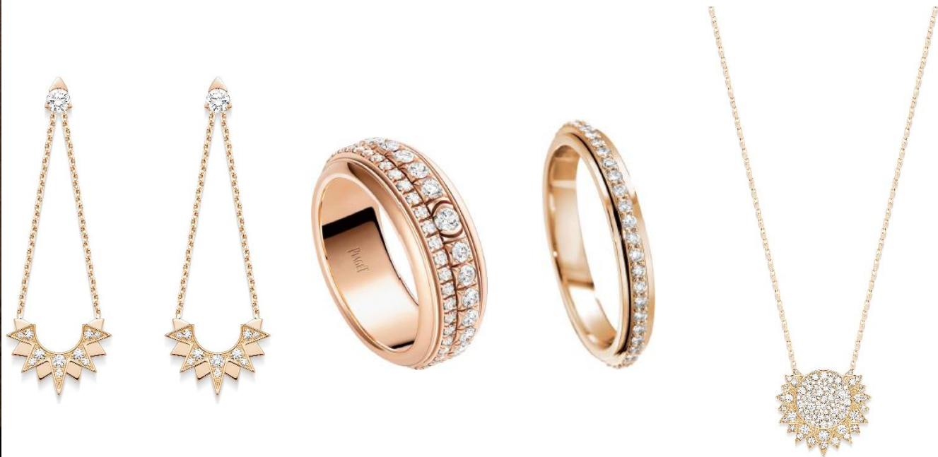
Worn by Lupita Nyong'o as Khadijah in THE 355