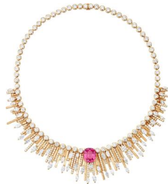
Worn by Diane Kruger as Marie in THE 355